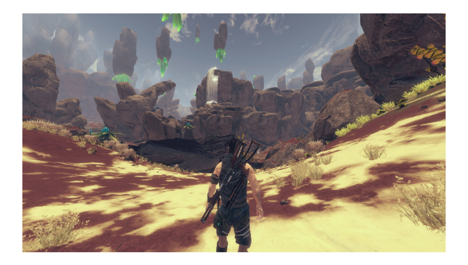
Exoplanet: First Contact Ativador Download [full Version]

Download ->>->> <a href="http://bit.ly/2NHSz2w">http://bit.ly/2NHSz2w</a>